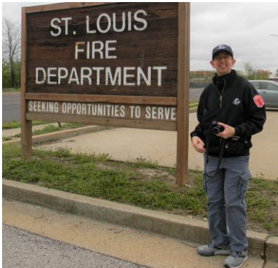
At the St. Louis Fire Dept.

Then my mom and I toured Firehouse #1 on Jefferson Avenue. House #1 took me on trips on two different fire trucks around the block in St. Louis city. I rode in the Captain's seat both times. I got to see the Strike Force trailer housed at House #1 in case of disaster and took many pictures. I also got an official St. Louis Fire Department House #1 tee-shirt that I'll wear sometime. It was a whale of a time!