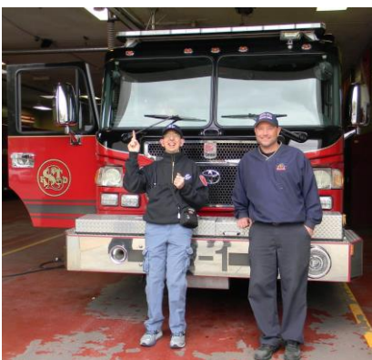
Immediate left: House #1 is Number One. I with one of the firefighters in front of one of the trucks I rode in.