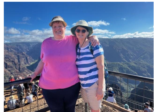
In Kawaii we visited the Grand Canyon of the Pacific, Waimea Canyon.