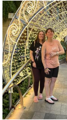
Immediate left: Light tunnel