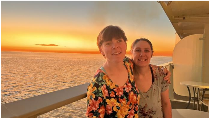
Far left: Sunset