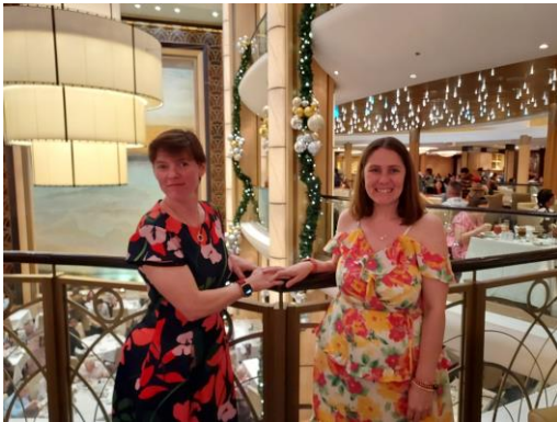
Far left: Girls dressed up