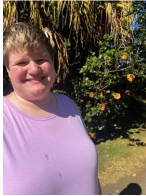
Beautiful flowers were everywhere