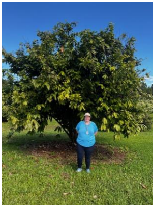
Cocoa tree in Hilo