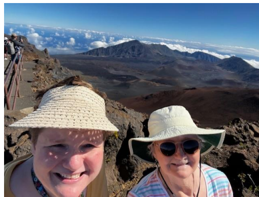
On Maui we visited the Haleakala Crater up above the clouds.