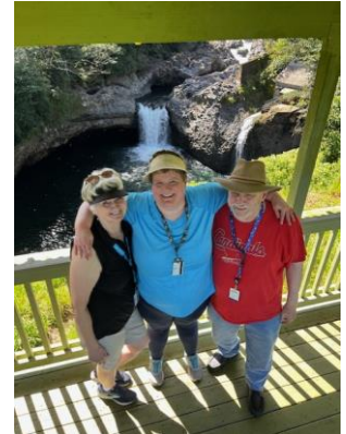
Rainbow Falls in Hilo