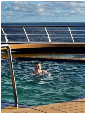
As usual, the pool was her favorite place